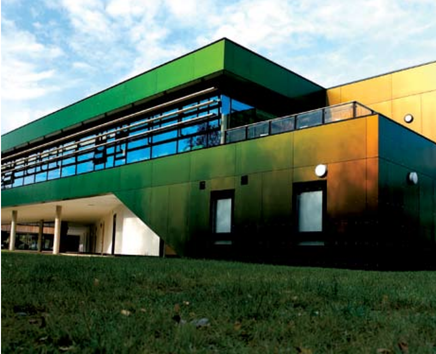
Innovation Centre Lincoln, UK equipped with Rockpanel® chameleon cladding