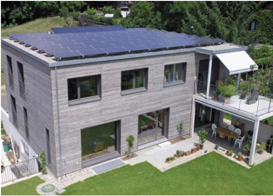
Newly built double family house, Riehen, Switzerland (Setz Architektur, Switzerland)

Two examples from Switzerland illustrate even further reductions in energy demand. The first example from Basel shows how a multiple family home was renovated so that it needs zero energy for heating, hot water and air ventilation system with heat recovery.