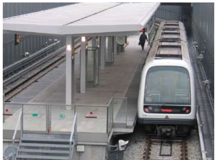
Copenhagen Metro – using RockDelta® anti-vibration mats