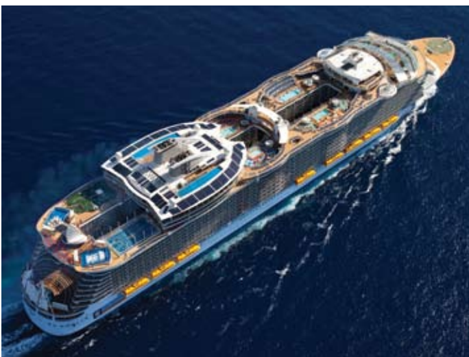
Oasis of the Seas – insulated with stone wool