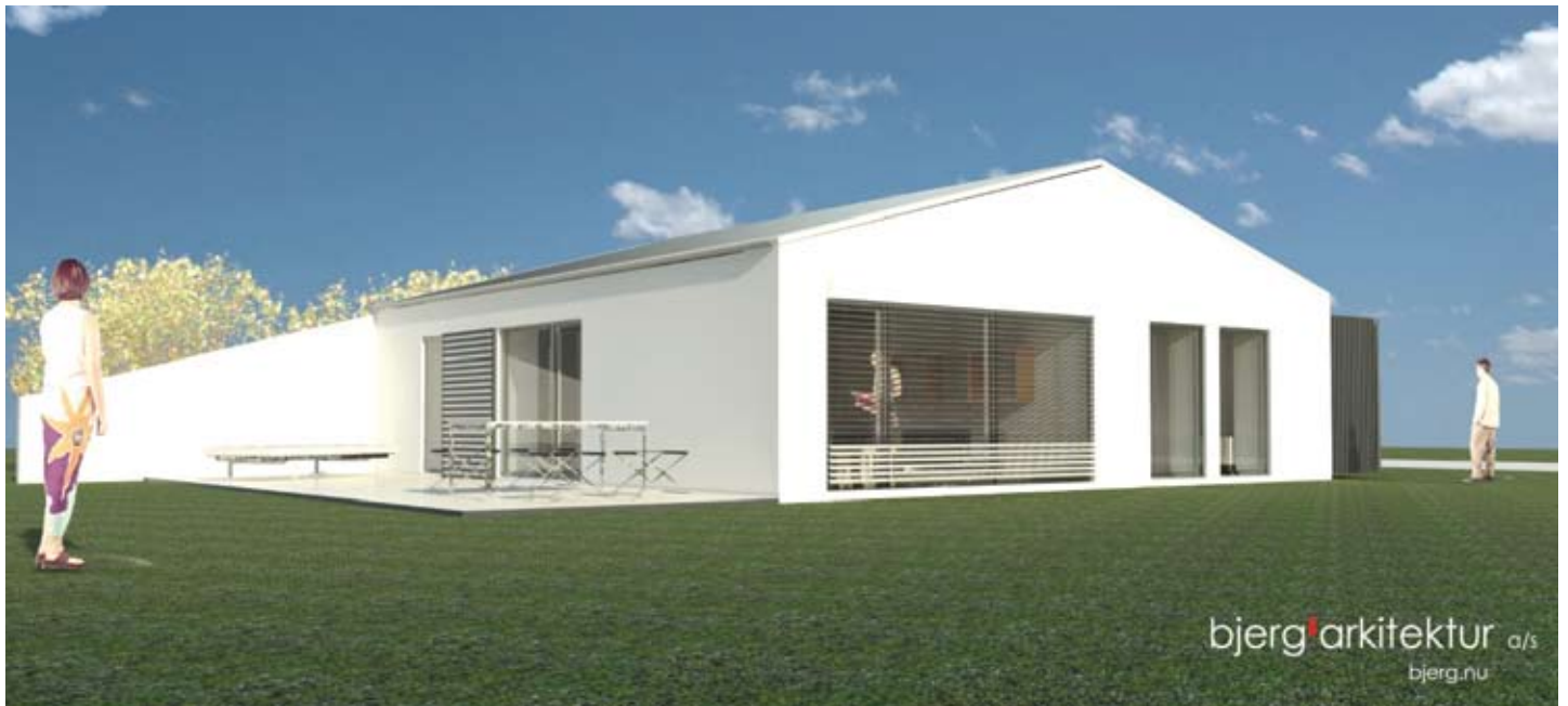
Passivhaus, Hjørring, Denmark