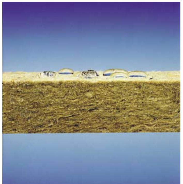
Water-repellent properties of Rockwool stone wool

Moisture and nutrients are necessary conditions for mould growth. Since more than 95% of Rockwool insulation products are made up of inorganic fibres, there is little nutrient source to allow fungal growth. Because of this and the product's water repellence, there is no need to add fungicide (Klamer et al.).