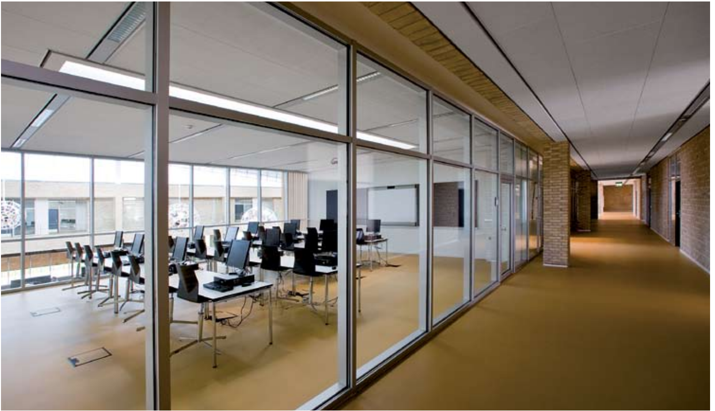
Classroom at A.P. Moller School, Schleswig, Germany, using Rockfon® ceiling tiles

A good wall construction using Rockwool insulation will help reduce noise transmission by more than 50 decibels (dB) – approximately 20 dB more than a construction without insulation. To put this in context, to humans, a 10 dB difference is heard as a doubling (or halving) of the audible sound (Climate & Environment).