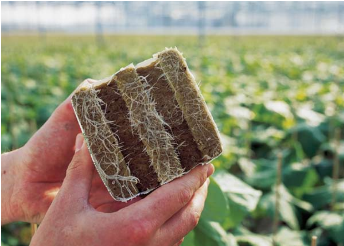
Greenhouse using Grodan® products for growing cucumbers

The Rockwool Group has approximately 8,000 employees in more than 30 countries – and customers all over the world. The group has been producing stone wool for more than 70 years and has currently 21 factories across Europe, North America and Asia (Climate & Environment).