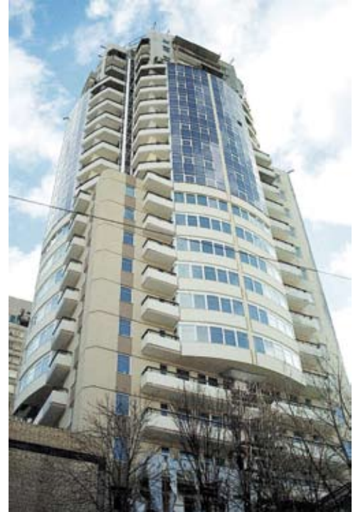
Warsaw, Poland – Rockwool based ETICS solution