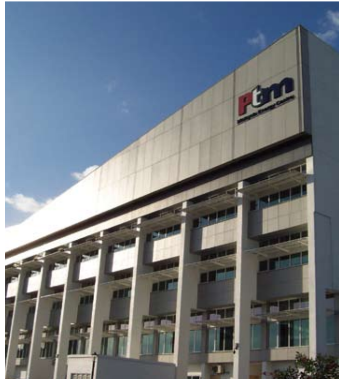
Malaysian Energy Centre Building, Bangi, Malaysia

This confirms that Rockwool products are secure to handle.