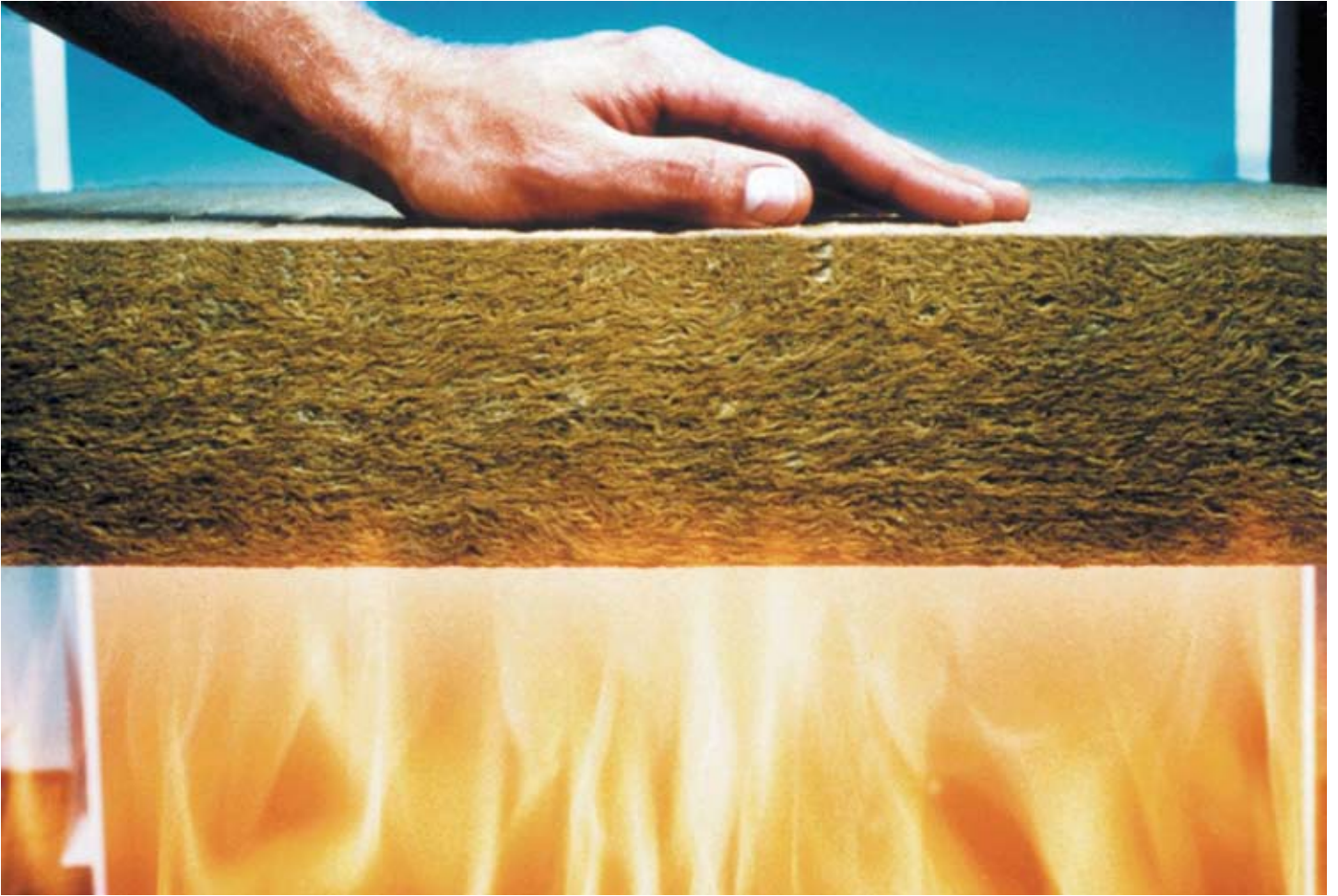
Fire-retardant properties of Rockwool stone wool