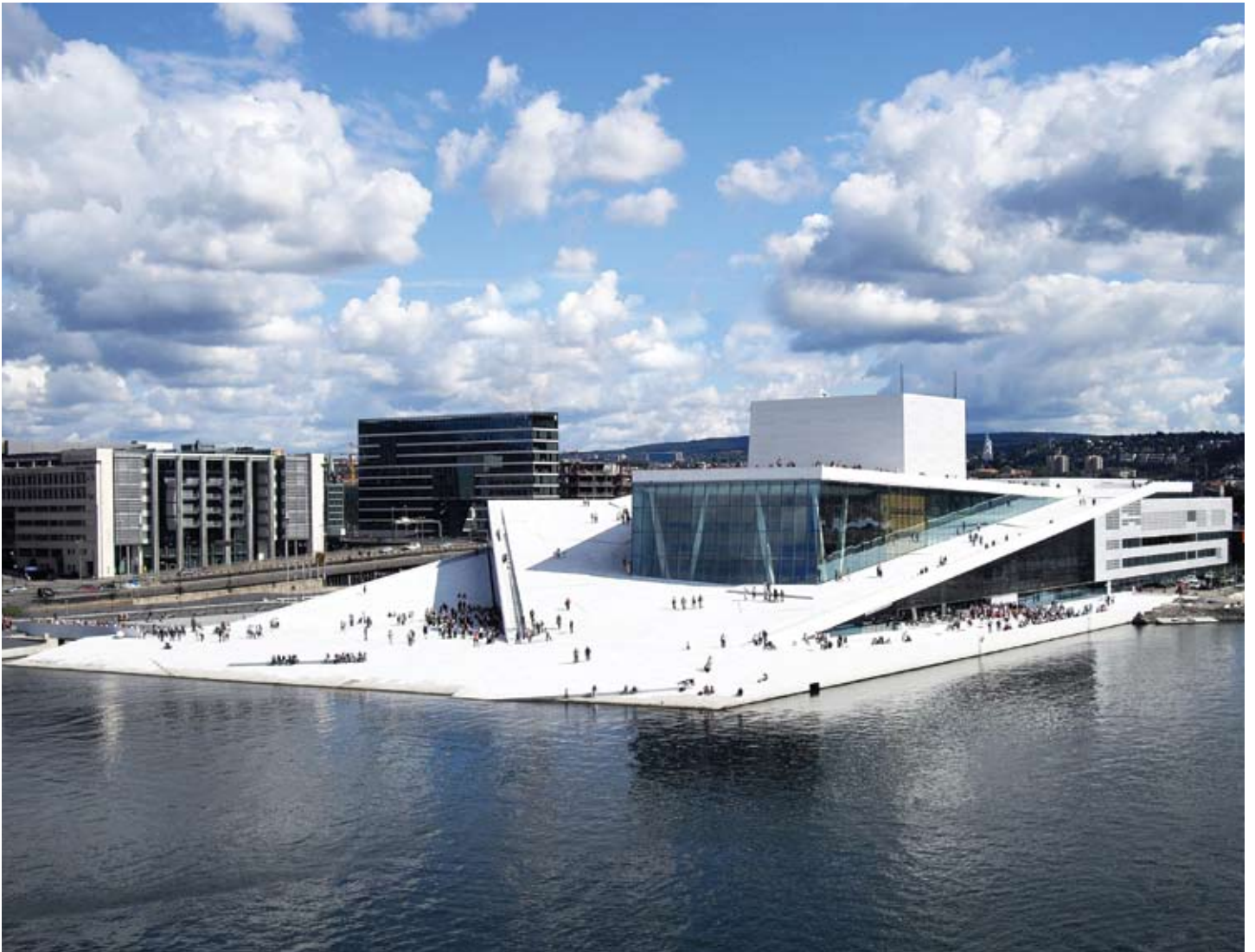
Oslo Opera House – using Rockwool stone wool