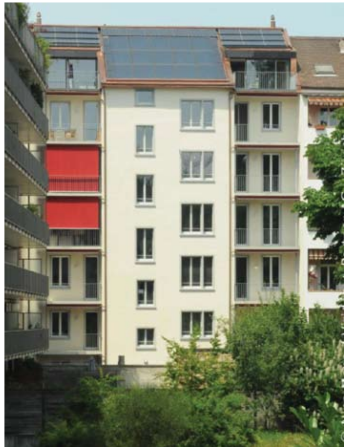
Renovated multiple family home, Basel, Switzerland (Viridén + Partner AG, Zurich)

As the name implies, measures necessary to achieve a Passivhaus are mainly passive. Once installed, they perform throughout the lifetime of the building without needing maintenance, except for a change of ventilation filter once or twice a year.